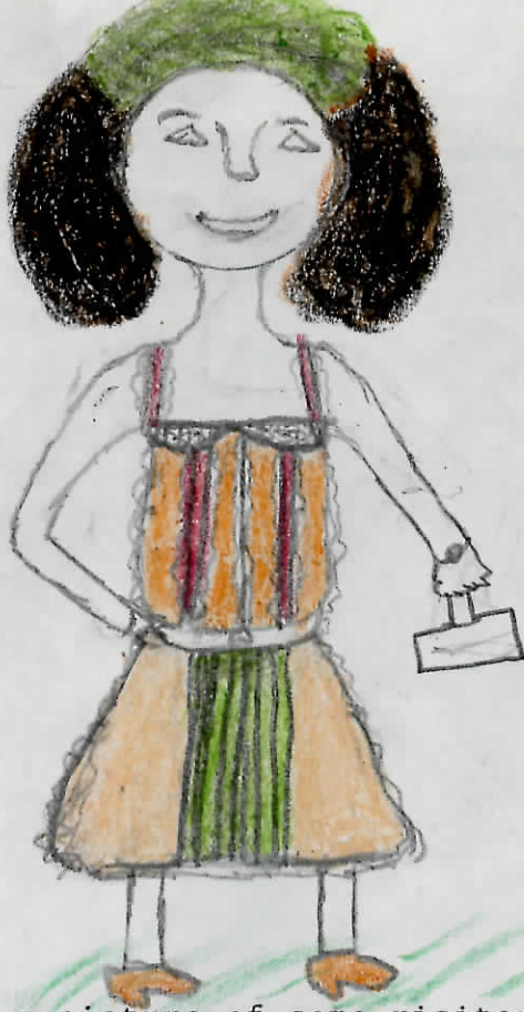
Draw a picture of some visitors who have come to Jamaica from far away.

If you would like to explain your drawing, use this space.